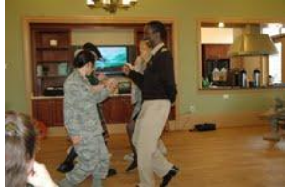
The Military Haymaker