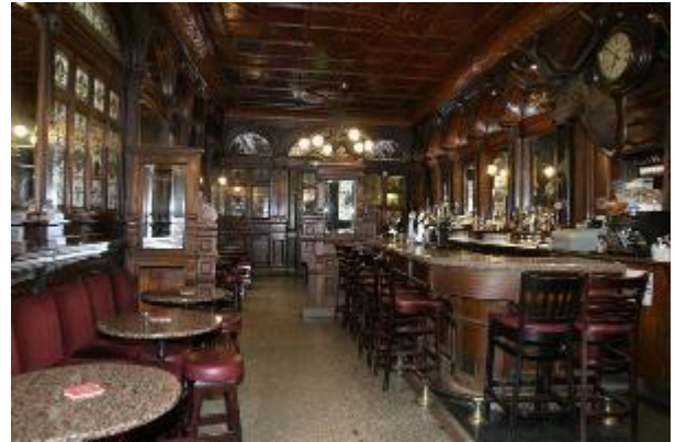
The Stag’s Head Pub